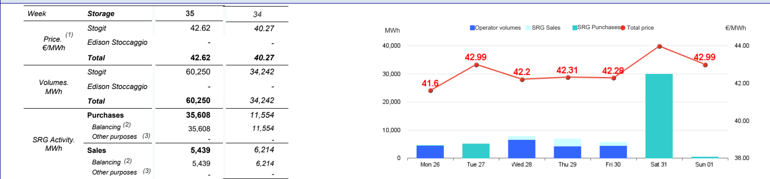
Market for the trading of gas stored (MGS-GAS)

The Total price is calculated as a weighted average price for the total volumes exchanged in each storage system. To securely manage any expected deviations between overall network injections and withdrawals pursuant to Art. 2.5 of Annex A, AEEGSI's Resolution 312/2016/R/gas Stored gas trades by Snam Rete Gas (SRG) not included in "Balancing"